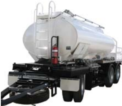
Dog trailer 10,000L DG Approved for Flammables - 1,2 and 3 comp.