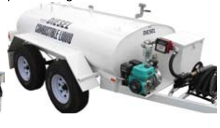
Conventional diesel trailers in 1k, 2k and 3500L versions. Reg'ble & unreg'ble with range of pumpsets