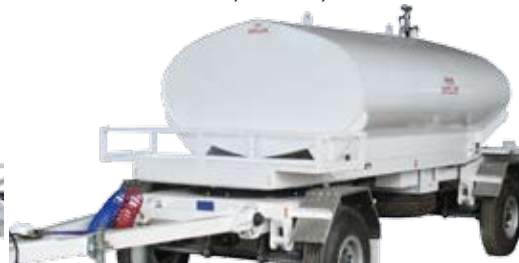
Dog trailers for diesel - reg'ble & unreg'ble