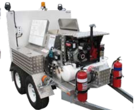
Aviation fuel quality test & hydrant pit cleaning