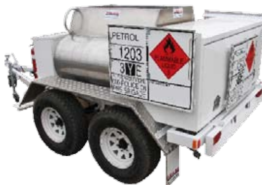
Dangerous Goods Approved trailers for Class 3 Flammables - Petrol, AvGas, Jet-A1.