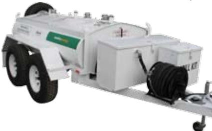
Tri-compartment transformer oil with special 2 way pumping equipment