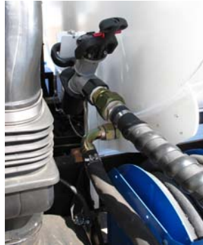
Wiggins nozzle secured in holster