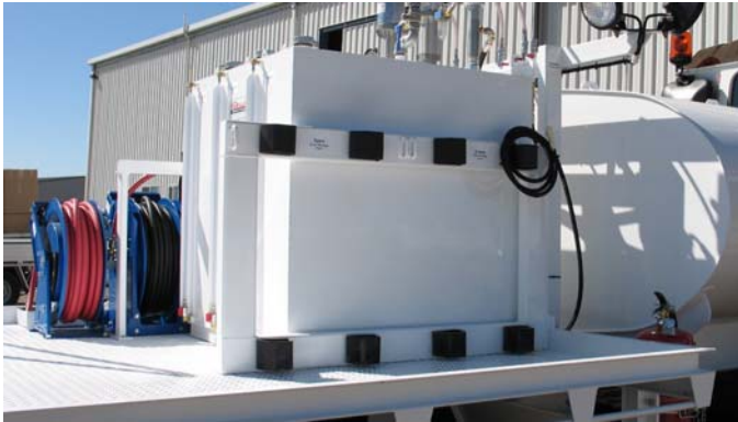
Shows two positions for 205 litre drums - 1 x for grease and 1 x for lubricant.