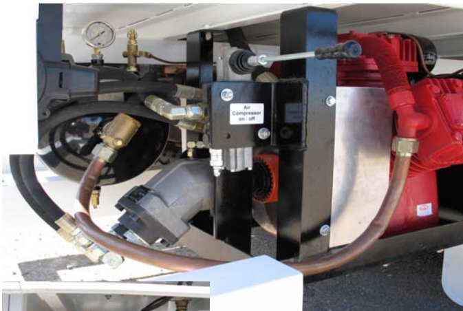
Huge 55 cfm tri-cylindar cast iron air compressor with hydraulic drive powers the onboard pumps and supplies air power for other tasks as required.