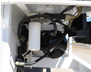
Air receiver tank