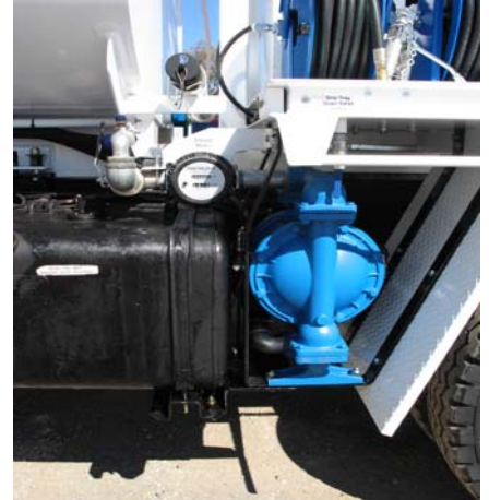
Diesel is dispensed by 38mm air-operated diaphragm pump and measured through 38mm Macnaught flow-