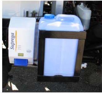
Basic handwash station with cleaner & water