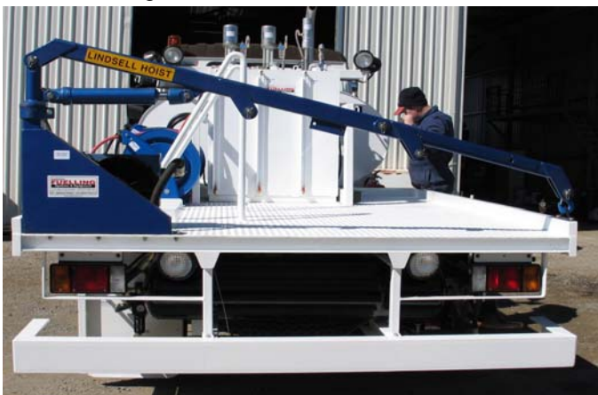
Heavy duty steel bumper protects rear of vehicle