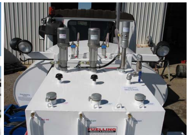
Multi-compartment tank with sight tubes, lockable fill caps. Oil tanks have filtered vents.

Oil pumps are 5:1 ratio, coolant pump is 3:1 stainless steel.