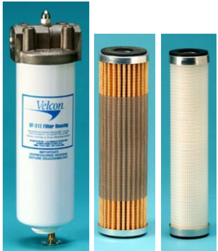
VF-31E Filter Housing

Aquacon Cartridges are also excellent dirt filters. Silt, rust, and other particulates are removed by the cartridge’s outer filter media. 5 and 25 micron rated cartridges are available for use with fuels and oils. The ACA-210 cartridge, for use with compressed air and other gasses, has a 1 micron rating.