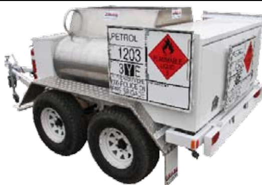
Dangerous Goods Approved trailers for Class 3 Flammables - Petrol, AvGas, Jet-A1.