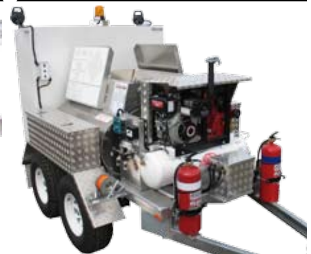
Aviation fuel quality test & hydrant pit cleaning