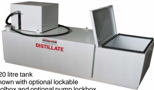
420 litre tank shown with optional lockable toolbox and optional pump lockbox