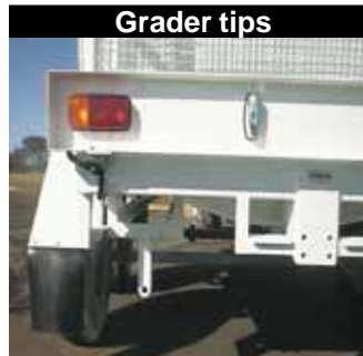
Lockable compartment for spare grader blade tips under tank