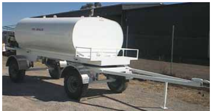
Front view of trailer showing drum rack/equipment tray