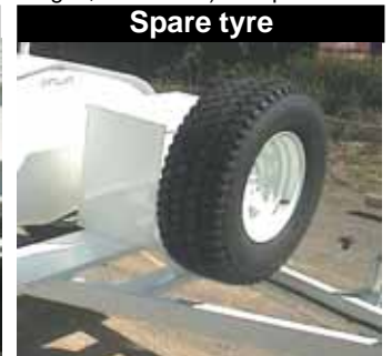
Spare tyre fitted with lockable bracket

All pumping systems and chosen options are fitted and wet tested when ordered with trailer