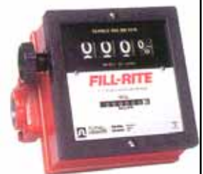
Cat 050403 FillRite 901 flowmeter 38mm ports 2% +/- @ 23-152 LPM flow range