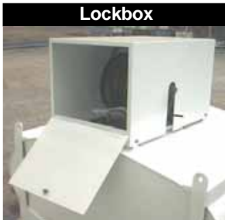
Optional lockboxes over pumps & equipment on top of tank.