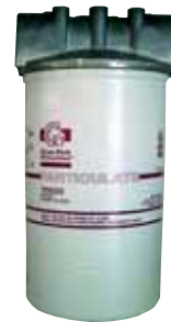
Cat 2330101- 38mm ports CimTek 30 micron filter