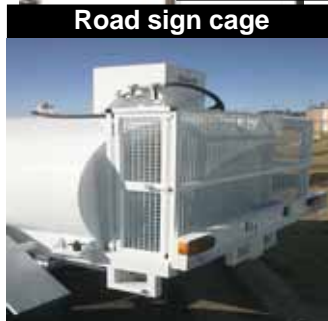
Custom made compartments to carry road signs fitted. Opens both sides