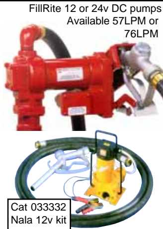
Cat 033332 Nala 12v kit

This is the most used pump type - available in either 12 or 24v and powered from either the towing vehicle/machine or can be a stand-alone unit with onboard battery with solar panel to recharge. We offer the FillRite range - these are heavy-duty, vane-type pumps, made in the USA and have a 2 year warranty. The FillRite range of DC pumps have SAA Approval for use with Class 3 Liquids (Petrol, Kero, Avgas, Jet-A1 etc) We also offer the Nala range of DC pumps - these are Italian-made & represent very good value for money. These have a 40LPM flow rate & come with a 1 year warranty.