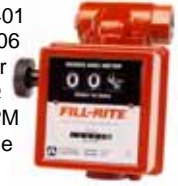
Cat 050401 FillRite 806 flowmeter 1% +/- @ 23-76 LPM flow range