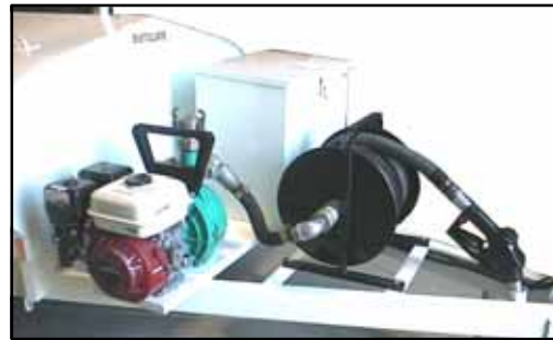
Standard pumpset includes engine/pump, delivery hose on reel, hi-flo auto nozzle & swivel & fittings

For applications where much higher flows (150-170 LPM) are required for larger machinery and to keep down-time to a minimum. Available with Honda or Villiers petrol engines (diesel available if required) with standard equipment fitted as shown below. A standard pumpset includes suction connection to the tank with valve & strainer, manual rewind reel with 6m x 32mm delivery hose and 25mm high flow automatic nozzle with swivel.