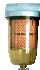
Cat 232901 Goldenrod 10 um filter 25mm BSP ports. Drain cock.