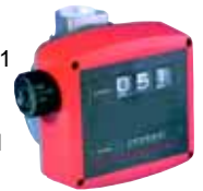
Cat 053320 Nala NT0001 flowmeter 1% +/- @ 20-120 LPM flow range

Solar power option - call. System is designed to suit flow demands of your application