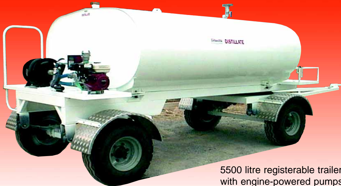
5500 litre registerable trailer with engine-powered pumpset

Proven design - low centre of gravity elliptical tank gives superior strength, handling & stability when travelling and easy, safe access to tank top for filling, dipping & dispensing fuel. The range of refuelling trailers from Australian Fuelling Systems & Equipment offer many built-in design features that make these vehicles an investment in long-term productivity. Available fitted with a wide range of accessories and pumping equipment to suit your needs - you specify the system to suit your application.