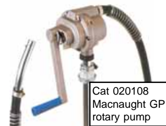
Cat 020108 Macnaught GP rotary pump

For a lot of applications, a geared rotary pump such as the Macnaught GP, offers fast, convenient refuelling at up to 100 LPM flow rate.