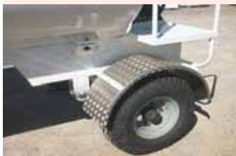
Aluminium mudguards and spring-loaded mounting brackets attaching tank to trailer frame